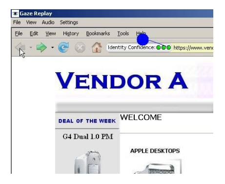
Fig. 3. A screenshot of the eye tracker replay function. The large circle near the identity confidence indicator shows the participant's fixation on that region of the screen.

In addition to the identity indicators being studied, seven participants also reported using the traditional indicators (the lock icon or https ) to help make decisions about identity and trust. The eye tracker data confirmed that these users did in fact fixate their gaze on the appropriate co-ordinates throughout the 7 tasks. There were also 4 participants who did not report using the traditional indicators in their decision-making but whose gaze fixated on their co-ordinates during most tasks.